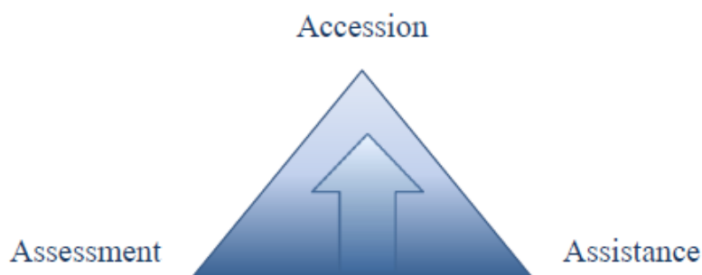
Figure 1: Accession, Assessment, Assistance

Accession is both an outcome and a process with specific steps from pre-candidacy to formal candidacy to milestones and date setting. Assistance , which refers to action, is how “Rule of Law” reform is supported from the outside through aid, diplomacy and various programmes, and is not EU specific. Between the two, assessment or the monitor of something labelled “progress” in the countries in question, constitutes both annual milestones for accession and guidelines for action, including aid. It is this dual character of assessment which complicates our task. In one sense, the concern for sustainability is shared by many in the “Rule of Law promotion” community around the world; but for the purpose at hand, we must combine the generic findings emanating from that front, with the special challenge associated with the sui generis “threshold” quality of enlargement. The questions differ: